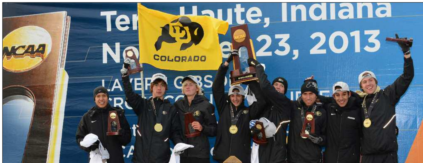
CU claimed its fourth NCAA men's cross country title in 2013.

Participation in the postseason was a common occurrence for the Pac-12 in 2013-14. Of the 22 sports it sponsors, 19 witnessed at least half its teams participating in NCAA or other postseason action. The men sent 79 of a possible 100 teams into the postseason (79.4 percent), while the women sent 83 of a possible 115 teams (72.2 percent).