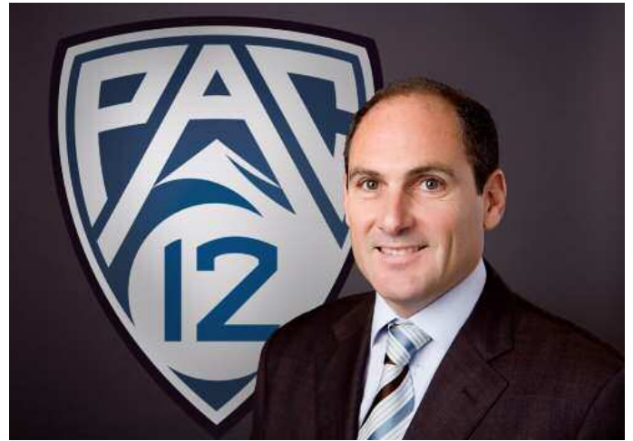
Pac-12 Commissioner Larry Scott

Colorado accepted its invitation to join the Pac-12 on June 11, 2010, as the Buffaloes were the first domino to fall in a change of the national landscape which, in just one week, saw Nebraska also leave the Big 12 and join the Big 10, Boise State depart the WAC for the Mountain West, TCU jump from the MWC for the Big East, and then on June 17, Utah agreeing to join CU to make it an even dozen in the Pac-12. Big-time rivals for the first half of the last century, the Buffaloes and Utes officially became the 11th and 12th members of the Conference on July 1, 2011, the first additions to the league since 1978. During the 33 years between expansions, Pac-10 teams claimed 258 NCAA titles (130 women's, 128 men's).